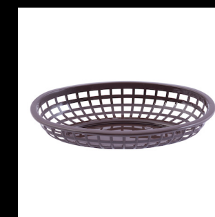
3 PIECE 28 OZ BAR SHAKER 1/1 CT OVAL BROWN BASKET 36/1 CT