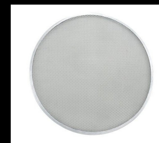
WINCO 8" SEAMLESS ALUMINUM PIZZA SCREEN 1 EA WINCO 16" SEAMLESS ALUMINUM PIZZA SCREEN 1 EA